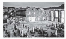
You can't come to Porto without indulging in a glass of the fortified sweet stuff. Start at the World of Wine (above), the world's largest wine museum.

the eye can see, are home to the world's oldest demarcated wine region. In fact, the Douro Valley is the birthplace of Porto's namesake, port wine. In 2020, while most cities were still trying to recover from the pandemic, Porto celebrated the opening of the