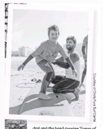
Whether it's surf or turf, there is plenty to see and do. Stop by its most famous bookstore, Livraria Lello (left), or ride the waves — with the aid of a pro (below).

Of course, the No. 1 water-based attraction in Porto is the Douro River. It forms the southern border of the city before carving its way through the adjacent Douro Valley. These terraced rolling hills, dotted with vineyards as far as